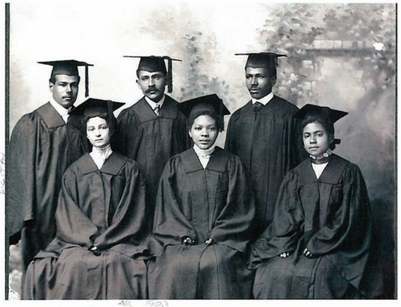
1903 Atlanta University graduating class