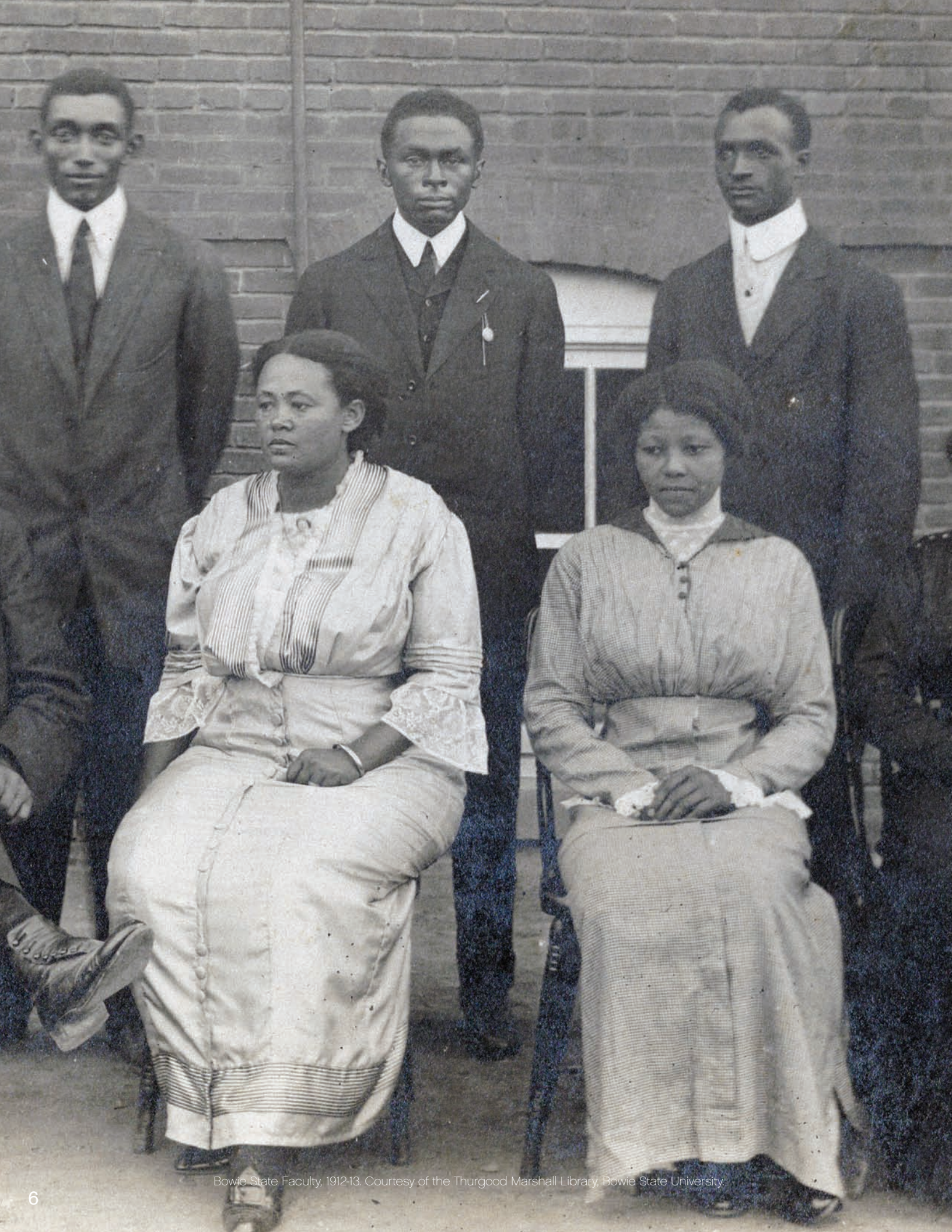
Bowie State Faculty, 1912-13.