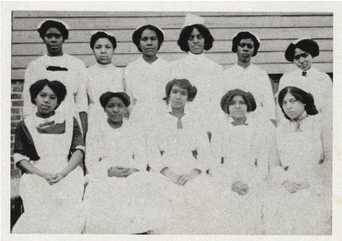
1916 Domestic Science Students, image courtesy of North Carolina Central University HBCU Library Alliance Digital Collection.