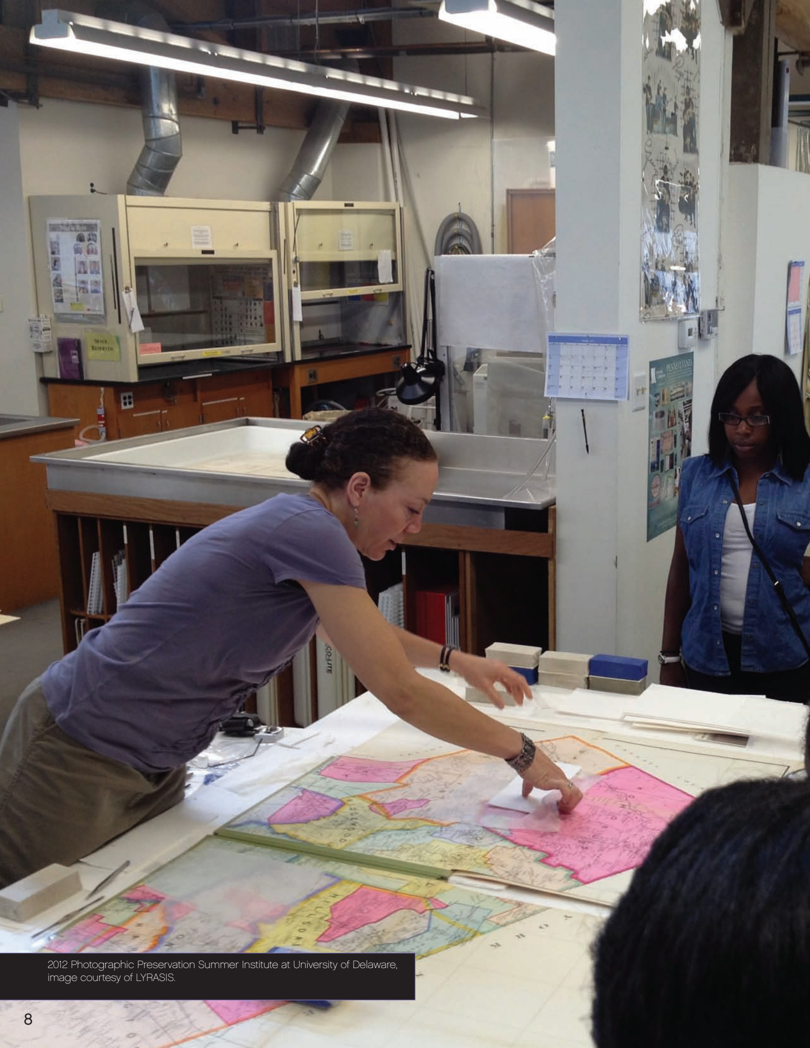
2012 Photographic Preservation Summer Institute at University of Delaware, image courtesy of LYRASIS.