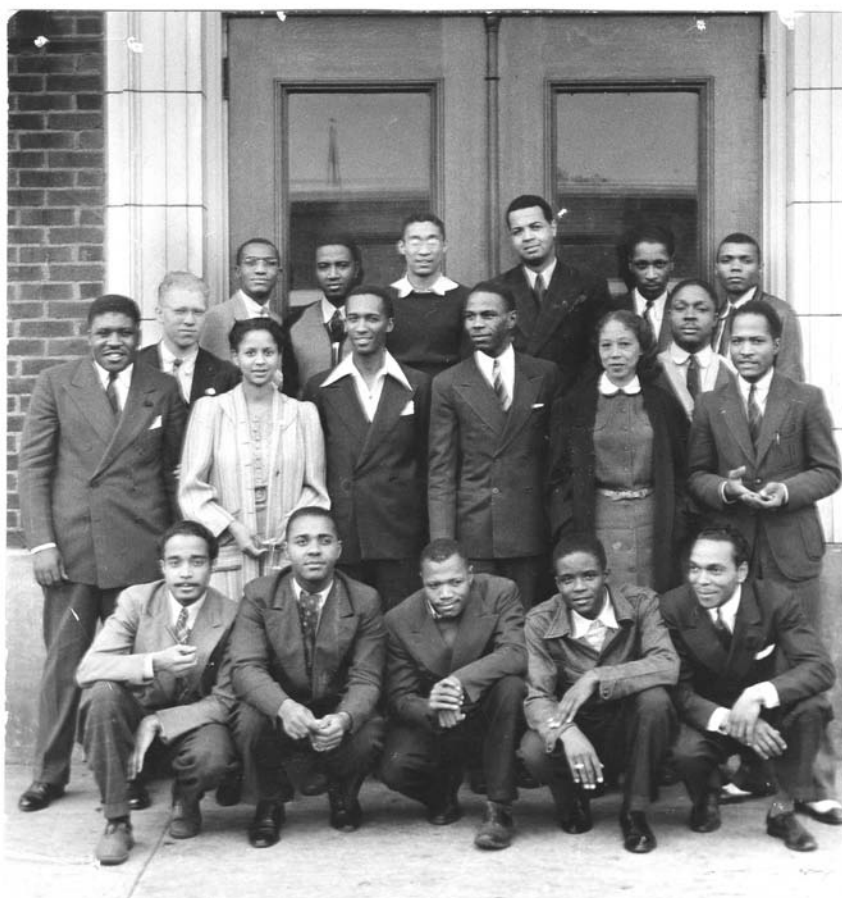
Members of Lincoln University (MO) Law School's Freshman Class