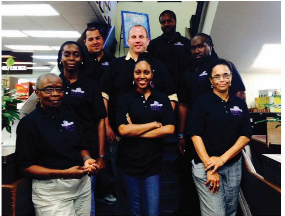
University of Virgin Islands library staff wearing HBCU Library Alliance Polos.