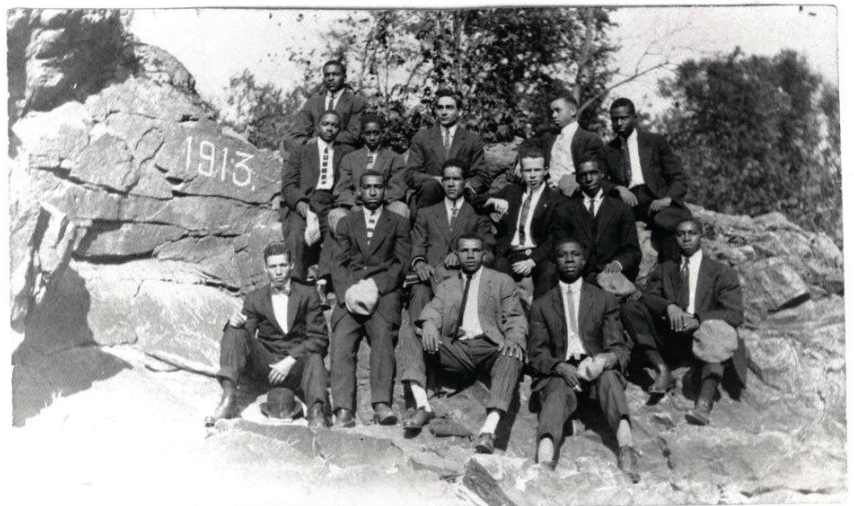
Virginia State University, At the Rocks