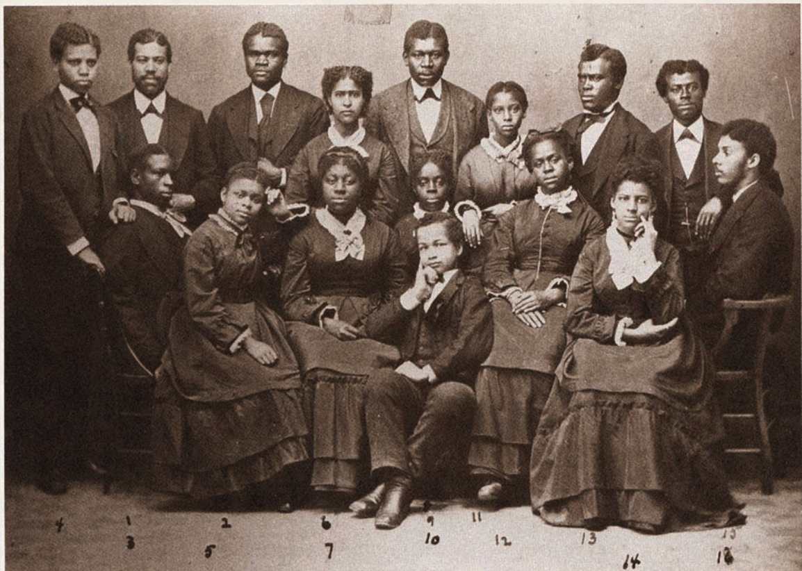
1874 Hampton Singers, image courtesy of HBCU Library Alliance Digital Collection.